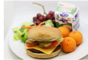
Hamburger, Cheeseburger, or Veggie Burger