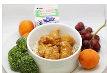
Orange Chicken with Rice