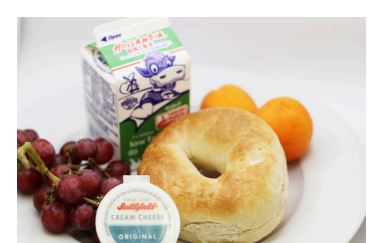
Turkey Sausage and Cheese Croissant OR Bagel & Cream Cheese