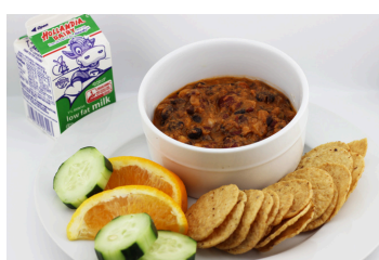
Vegetarian Chili and Tortilla Chips