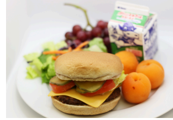
Hamburger or Cheeseburger