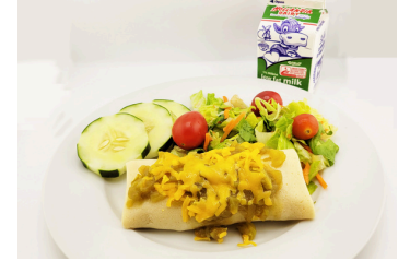
Green Chili and Cheese Tamale