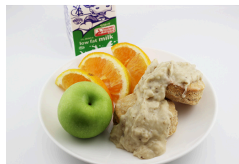
Biscuits and Gravy OR Pan Dulce