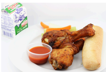
Oven Roasted Chicken Wings or Vegetarian Chicken Nuggets