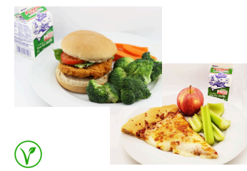
Chicken Sandwich, Vegetarian Chicken Sandwich, or WaveCrest Pizza