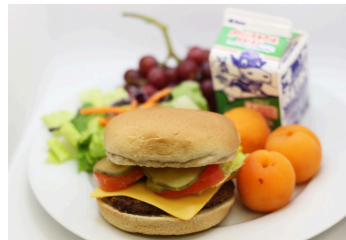
Hamburger, Cheeseburger, or Veggie Burger