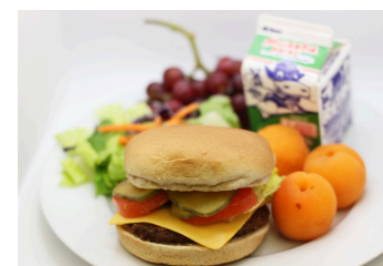
Hamburger or Cheeseburger