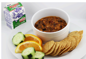
Vegetarian Chili and Tortilla Chips