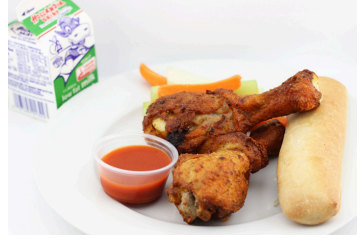
Oven Roasted Chicken Wings or Vegetarian Chicken Nuggets