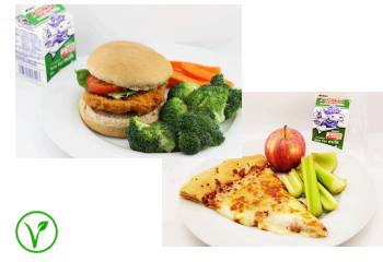
Chicken Sandwich, Vegetarian Chicken Sandwich, or WaveCrest Pizza