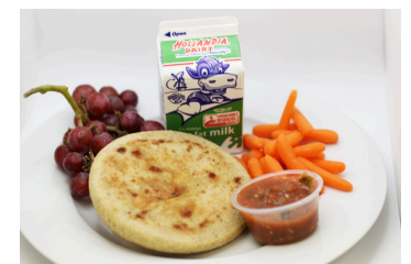
Bean & Cheese Pupusa