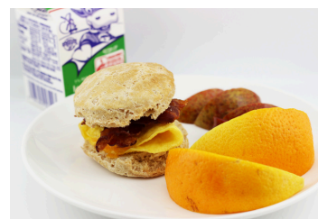
Bacon, Egg, and Cheese Biscuit OR Pan Dulce