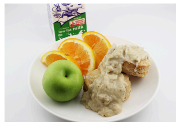
Biscuits and Gravy OR Pan Dulce