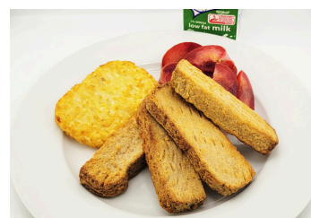
French Toast with Hash Brown Patty OR Cinnamon Roll