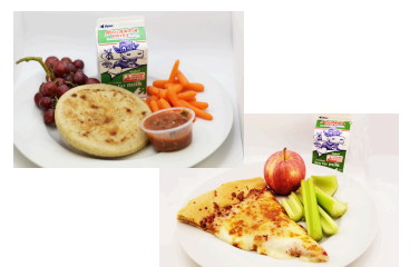
Bean & Cheese Pupusa or WaveCrest Pizza