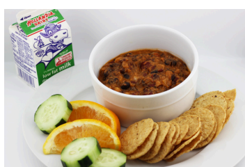
Vegetarian Chili and Tortilla Chips