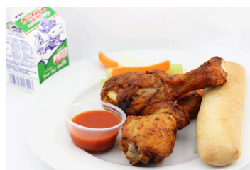
Oven Roasted Chicken Wings or Vegetarian Chicken Nuggets