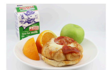
Pepperoni and Cheese Croissant OR Bagel & Cream Cheese