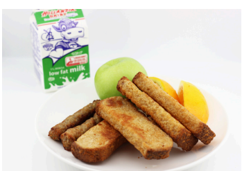
French Toast with Sausage Links OR Pan Dulce