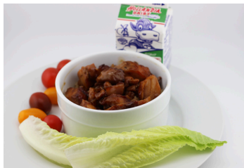
Teriyaki Chicken with Rice