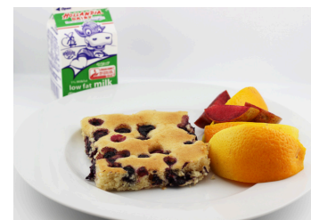
Blueberry Lemon Bread OR Pizza Toast