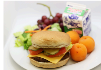
Hamburger, Cheeseburger, or Veggie Burger