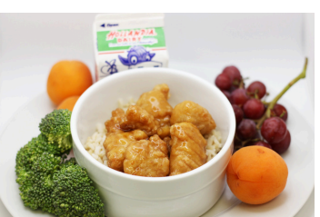
Orange Chicken with Rice