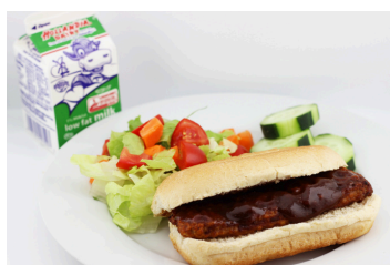
BBQ Rib Sando