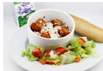
Chicken Parm Bowl