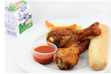
Oven Roasted Chicken Wings or Vegetarian Chicken Nuggets