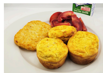
Bacon & Cheese Egg Bites with Hash Brown Patty OR Cinnamon Roll