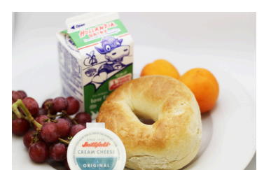
Turkey Sausage and Cheese Croissant OR Bagel & Cream Cheese