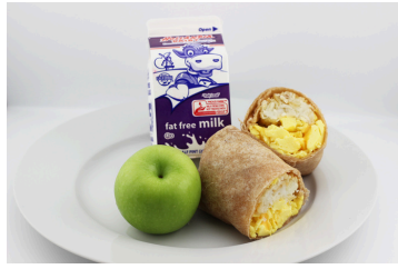
Breakfast Burrito (Egg, cheese, hash brown) OR Benefit Bar