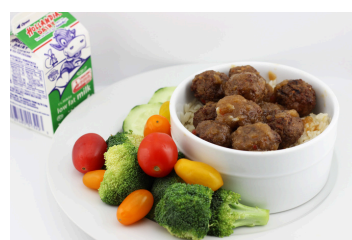
BBQ Korean Meatballs with Rice