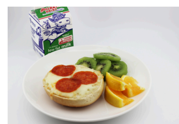
Pizza Toast with Bagel OR Yogurt Parfait