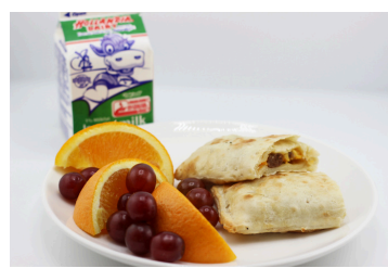
Sausage and Cheese Burrito OR Campfire Crunch Bar