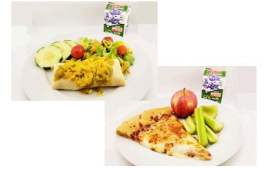
Green Chili and Cheese Tamale or WaveCrest Pizza