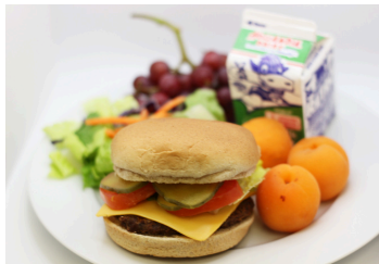
Hamburger, Cheeseburger, or Veggie Burger