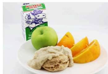
Biscuits and Gravy OR Pan Dulce