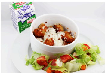
Chicken Parm Bowl