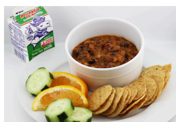
Vegetarian Chili and Tortilla Chips