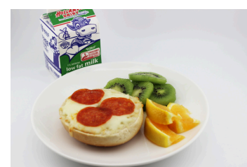
Pizza Toast with Bagel OR Yogurt Parfait