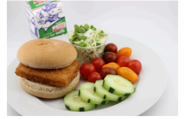
Surfside Fish Sandwich