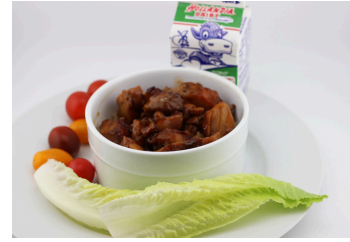
Teriyaki Chicken with Rice