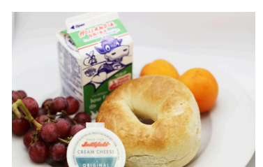
Turkey Sausage and Cheese Croissant OR Bagel & Cream Cheese