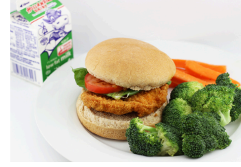
Chicken Sandwich or Vegetarian Chicken Sandwich