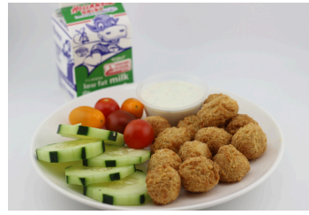
Popcorn Chicken Vegetarian Chicken Nuggets