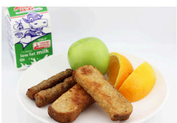
French Toast with Sausage Links OR Pan Dulce