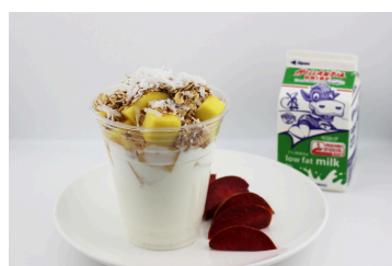
Build Your Own Parfait