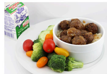
BBQ Korean Meatballs with Rice