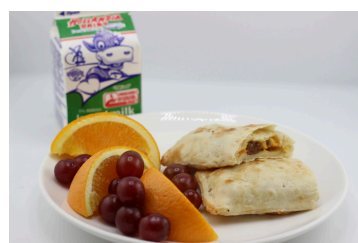
Sausage and Cheese Burrito OR Campfire Crunch Bar