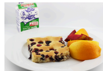
Blueberry Lemon Bread OR Pizza Toast