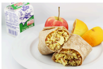
Bacon, Egg & Cheese Burrito OR Benefit Bar