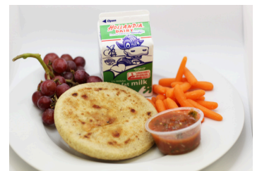
Bean & Cheese Pupusa