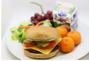
Hamburger or Cheeseburger