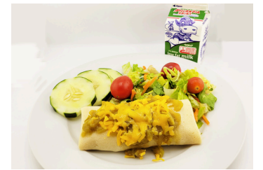
Green Chile and Cheese Tamale