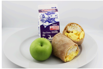
Breakfast Burrito (Egg, cheese, hash brown) OR Benefit Bar