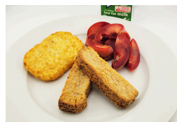
French Toast with Hash Brown Patty OR Cinnamon Roll