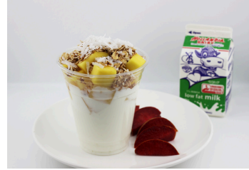
Pizza Toast OR Yogurt Parfait