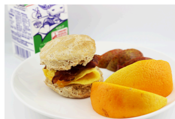
Bacon, Egg, and Cheese Biscuit OR Pan Dulce