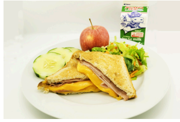
Grilled Ham and Cheese Sandwich