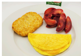
Omelet with Stuffed Hash Brown Patty OR Cinnamon Roll