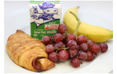
Ham & Cheese Croissant OR Bagel & Cream Cheese