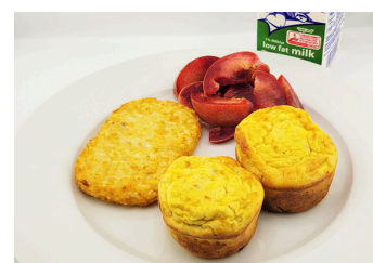
Bacon & Cheese Egg Bites with Hash Brown Patty OR Cinnamon Roll