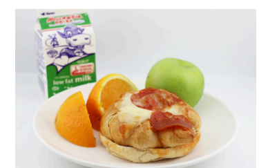
Pepperoni and Cheese Croissant OR Bagel & Cream Cheese