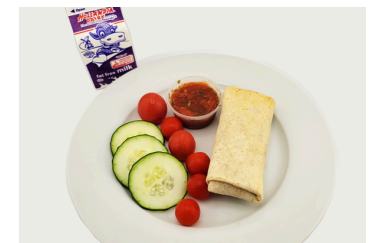
Bean & Cheese Burrito