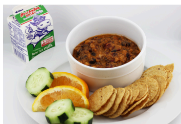
Vegetarian Chili and Tortilla Chips