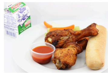
Oven Roasted Chicken Wings