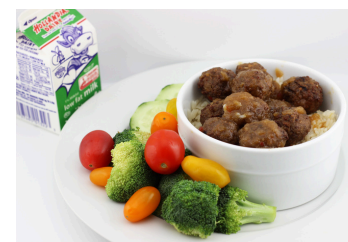
BBQ Korean Meatballs with Rice