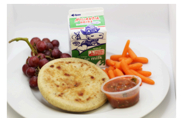
Bean & Cheese Pupusa