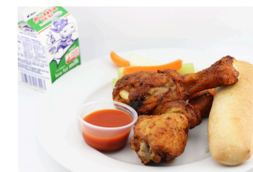
Oven Roasted Chicken Wings or Vegetarian Chicken Nuggets