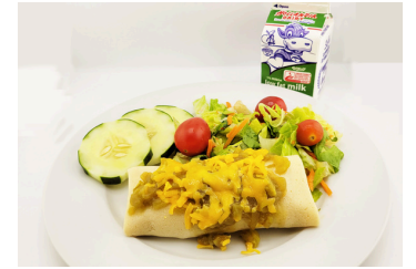
Green Chili and Cheese Tamale