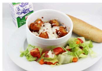
Chicken Parm Bowl