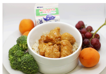
Orange Chicken with Rice