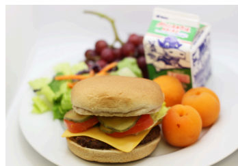
Hamburger, Cheeseburger, or Veggie Burger