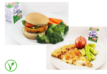
Chicken Sandwich, Vegetarian Chicken Sandwich, or WaveCrest Pizza