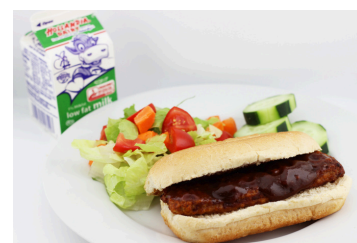
BBQ Rib Sando