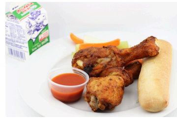
Oven Roasted Chicken Wings or Vegetarian Chicken Nuggets