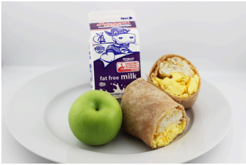
Breakfast Burrito (Egg, cheese, hash brown) OR Benefit Bar