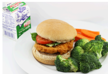
Chicken Sandwich or Vegetarian Chicken Sandwich