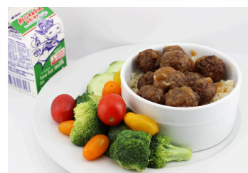
BBQ Korean Meatballs with Rice