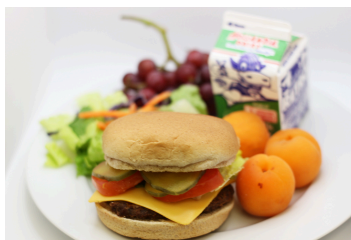
Hamburger, Cheeseburger, or Veggie Burger