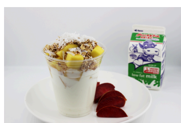
Build Your Own Parfait