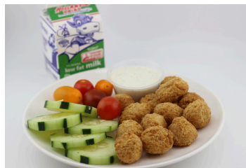
Popcorn Chicken Vegetarian Chicken Nuggets