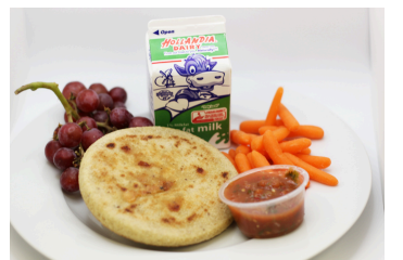
Bean & Cheese Pupusa