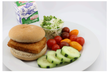
Surfside Fish Sandwich