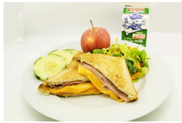
Grilled Ham and Cheese Sandwich