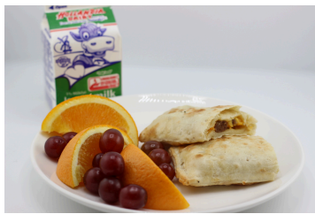
Sausage and Cheese Burrito OR Campfire Crunch Bar