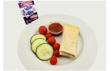
Bean and Cheese Burrito