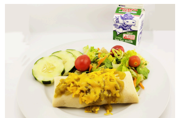
Green Chile and Cheese Tamale