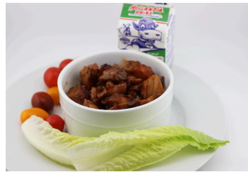
Teriyaki Chicken with Rice