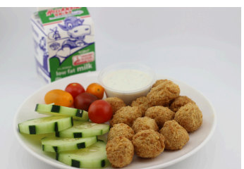
Popcorn Chicken Vegetarian Chicken Nuggets