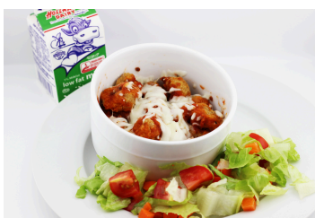
Chicken Parm Bowl