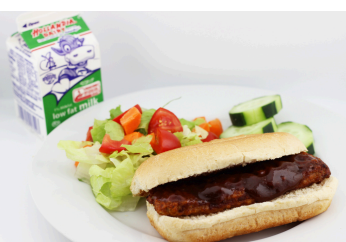
BBQ Rib Sando