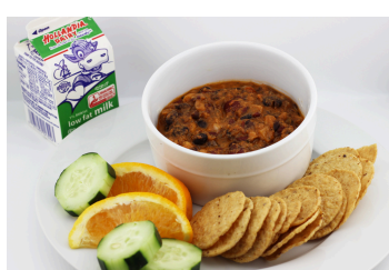
Vegetarian Chili and Tortilla Chips