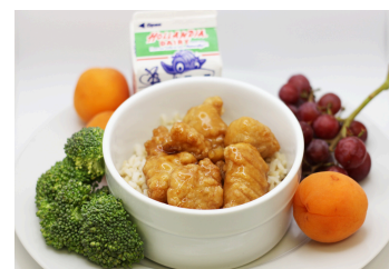
Orange Chicken with Rice