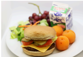
Hamburger or Cheeseburger