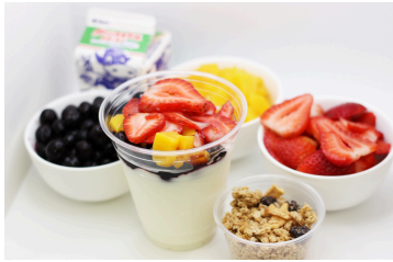
Build Your Own Parfait Bar