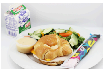
Turkey Cheese Croissant with Strawberry Yogurt