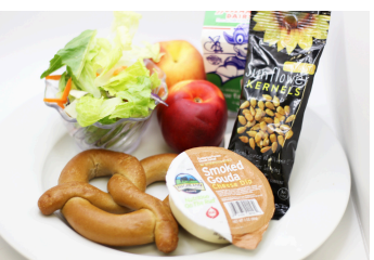
Soft Pretzel & Cheese