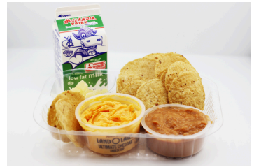
Nacho Bento Box