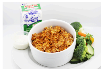
Pasta with Meat Sauce