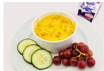
Mac & Cheese