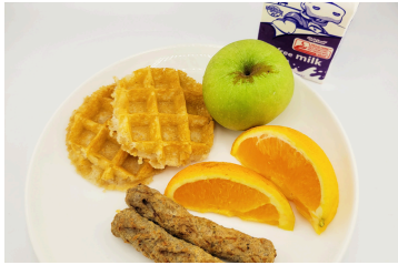
Mini Waffles with Sausage OR Breakfast Taquito