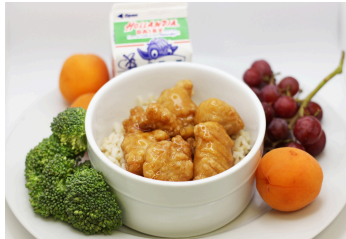
Orange Chicken with Rice