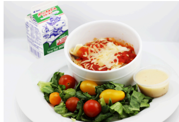
Stuffed Pasta Shells