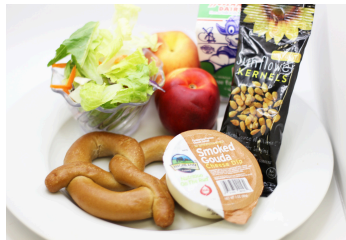
Soft Pretzel & Cheese