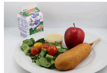
Corn Dog OR Plant-Based Hot Dog