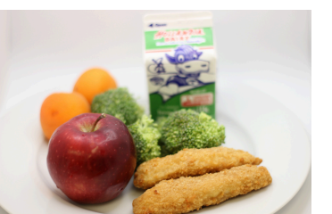
Chicken Tenders or Vegetarian Chicken Nuggets