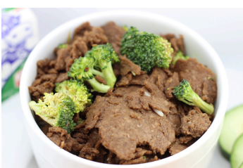
Beef & Broccoli with Rice