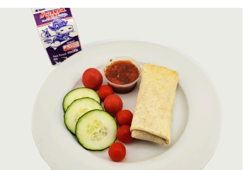
Bean & Cheese Burrito