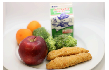
Chicken Tenders or Vegetarian Chicken Nuggets