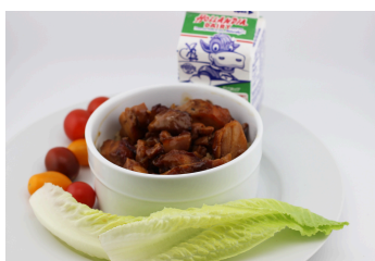
Teriyaki Chicken with Rice