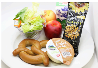
Soft Pretzel & Cheese