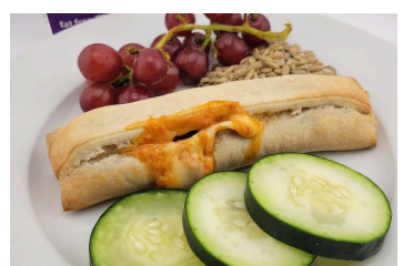
Bosco Sticks & Seeds