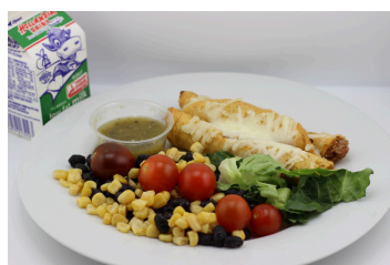
Black Bean Taquitos