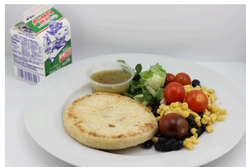
Bean & Cheese Pupusa