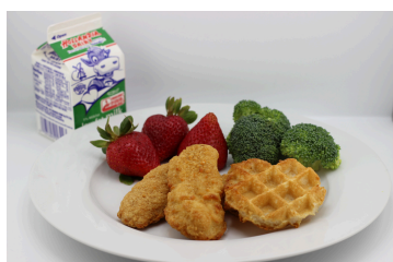
Chicken & Mini Maple Waffles