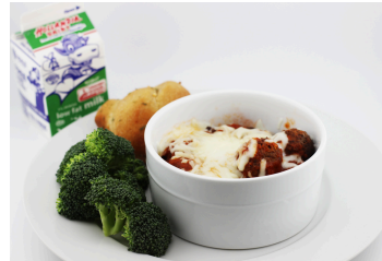
Meatball Bowl with Garlic Knot