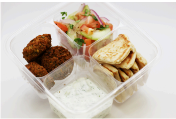
Mediterranean Bento Box