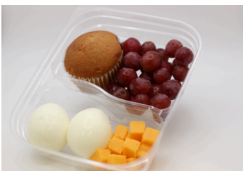
Breakfast Bento Box OR Bacon, Egg, & Cheese Croissant