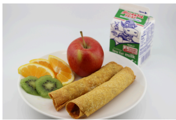
Breakfast Taquito OR French Toast Sticks