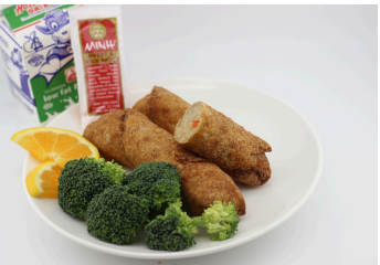
Whole Grain Chicken Egg Roll