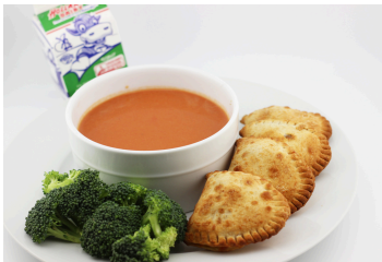
Tomato Soup with Mini Cheese Calzone Dippers