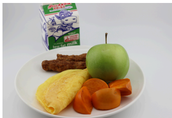
Egg & Cheese Omelet with Sausage Links OR Breakfast Bento Box