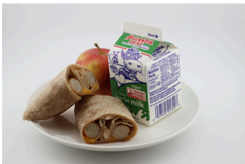
Sausage & Cheese Burrito OR Benefit Bar