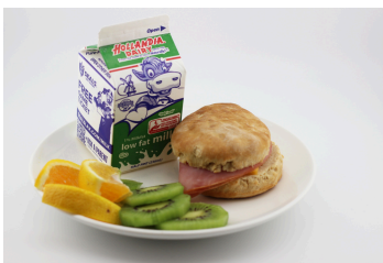
Ham & Cheese Biscuit OR Banana Bread Square