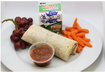
Bean & Cheese Burrito