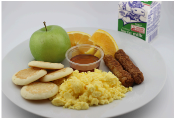
Egg, Sausage Link, & Pancake Bites OR Blueberry Muffin