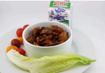
Teriyaki Chicken & Fried Rice