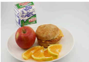
Egg & Cheese Biscuit Sandwich OR Pan Dulce