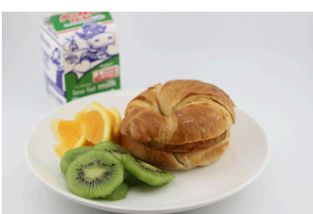
Pork Sausage, Egg & Cheese Croissant Sandwich OR Pancake Bites