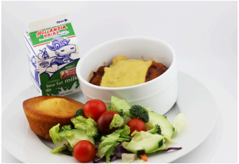
Ballpark Loaded Tater Tots with Cornbread Muffin