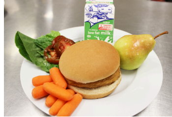
Chicken Sandwich; Spicy Black Bean Burger