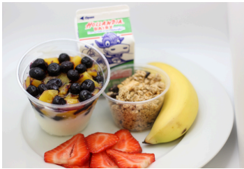
Yogurt Parfait OR Ham & Cheese Breakfast Burrito