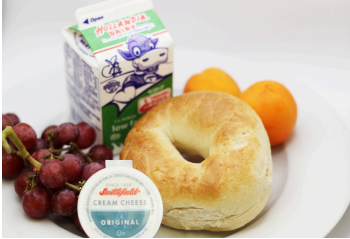
Bagel & Cream Cheese OR Breakfast Taco