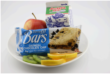
Benefit Bar OR Sausage & Cheese Burrito

1/6, 1/27, 2/17, 3/10, 3/31, 4/21, 5/12, 6/2