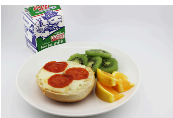
Pizza Toast with Bagel OR Yogurt Parfait