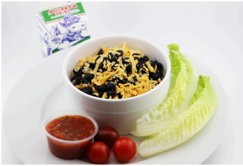
Vegetarian Burrito Bowl

1/6, 1/27, 2/17, 3/10, 3/31, 4/21, 5/12, 6/2