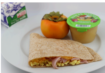
Breakfast Quesadilla OR Pan Dulce