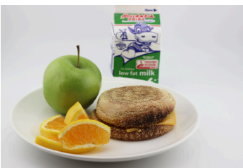
English Muffin with Pork Sausage Patty & Cheese OR Yogurt Box