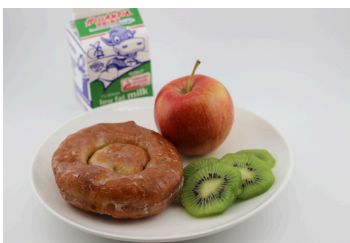
Pizza Toast with Bagel OR Apple Fritter