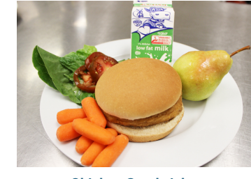
Chicken Sandwich; Spicy Black Bean Burger