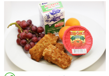
V Pizza Crunchers