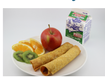
Breakfast Taquito OR French Toast Sticks