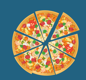
PIZZA CHOICES Pepperoni, Cheese 😗 Hawaiian