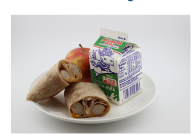
Sausage & Cheese Burrito OR Benefit Bar