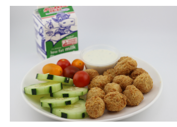
Popcorn Chicken Bites