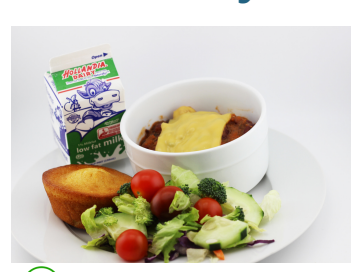
(V) Ballpark Loaded Tater Tots