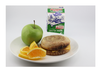
English Muffin with Pork Sausage Patty & Cheese OR Yogurt Box