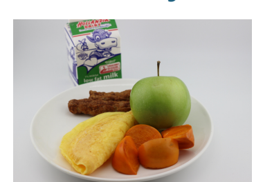
Egg & Cheese Omelet with Sausage Links OR Breakfast Bento Box