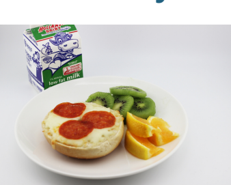
Pizza Toast with Bagel OR Yogurt Parfait