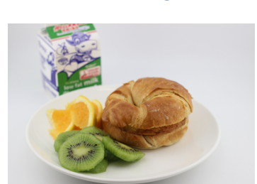
Pork Sausage, Egg & Cheese Croissant Sandwich OR Pancake Bites