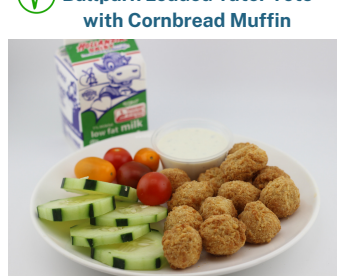
Popcorn Chicken Bites