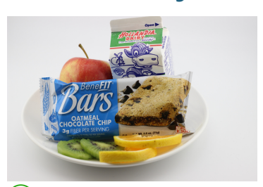
Benefit Bar OR Sausage & Cheese Burrito