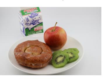
Pizza Toast with Bagel OR Apple Fritter