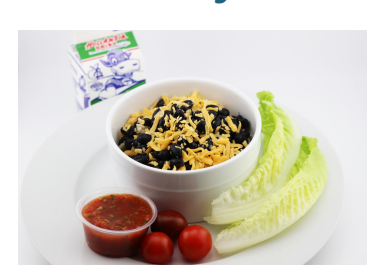
Vegetarian Burrito Bowl