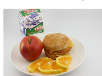
Egg & Cheese Biscuit Sandwich OR Pan Dulce