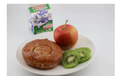
Pizza Toast with Bagel OR Apple Fritter