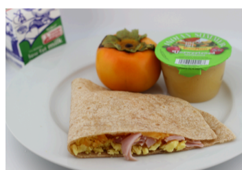
Breakfast Quesadilla OR Pan Dulce