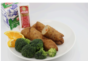
Whole Grain Chicken Egg Roll