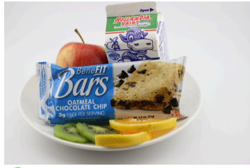
Benefit Bar OR Sausage & Cheese Burrito