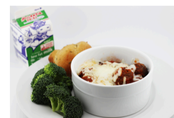
Meatball Bowl with Garlic Knot