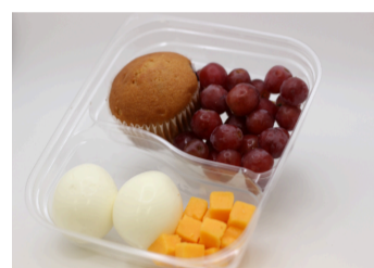
Breakfast Bento Box OR Bacon, Egg, & Cheese Croissant