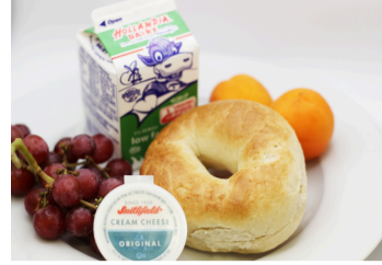
Bagel & Cream Cheese OR Breakfast Taco Crisp Up