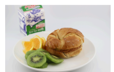
Pork Sausage, Egg & Cheese Croissant Sandwich OR Pancake Bites