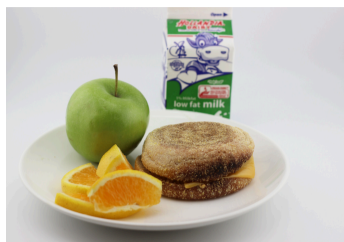
English Muffin with Pork Sausage Patty & Cheese OR Yogurt Box