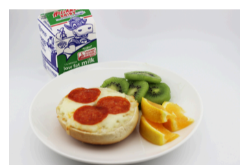
Pizza Toast with Bagel OR Yogurt Parfait