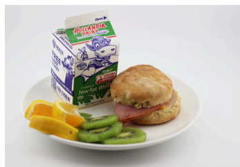
Ham & Cheese Biscuit OR Banana Bread Square