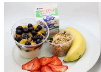
Yogurt Parfait OR Ham & Cheese Breakfast Burrito