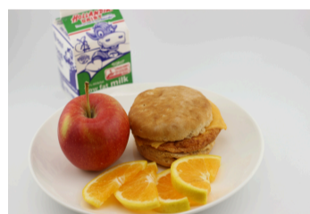
Egg & Cheese Biscuit Sandwich OR Pan Dulce