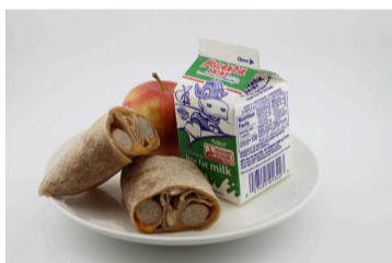
Sausage & Cheese Burrito OR Benefit Bar