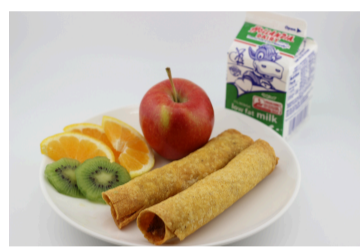
Breakfast Taquito OR French Toast Sticks