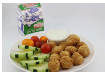
Popcorn Chicken Bites