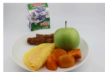
Egg & Cheese Omelet with Sausage Links OR Breakfast Bento Box