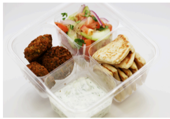
Mediterranean Bento Box