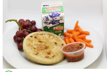
Bean & Cheese Pupusa