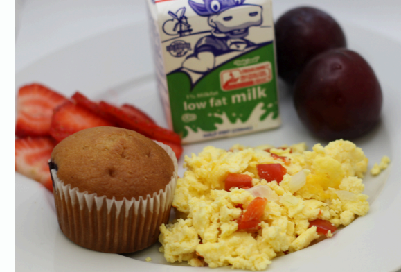
Breakfast Egg Scramble with Mini Muffin OR Cinnamon Roll