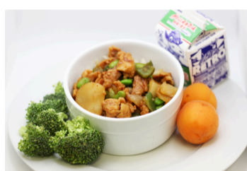
Edamame Kung Pao Chicken