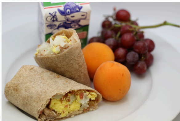
Egg, Potato, & Cheese Burrito OR Benefit Bar