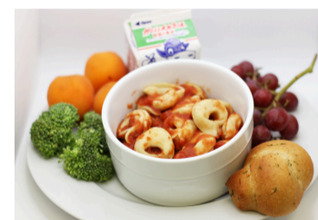
Tortellini with Marinara Sauce & Garlic Knot