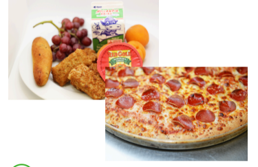
Pizza Crunchers with Garlic Breadstick OR WaveCrest Pizza