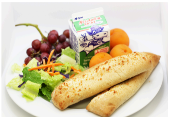
Cheesy Pizza Sticks