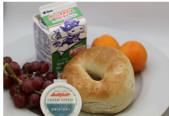
Pork Sausage & Cheese Croissant Sandwich OR Bagel & Cream Cheese