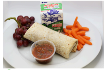
Bean & Cheese Burrito