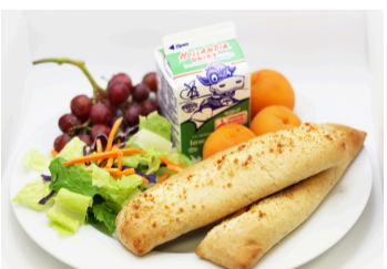
Cheesy Pizza Sticks