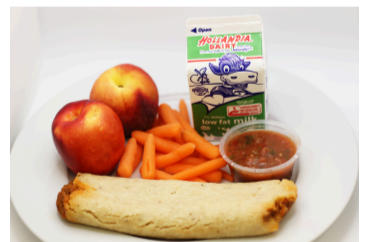
Chicken Tamale and Seeds