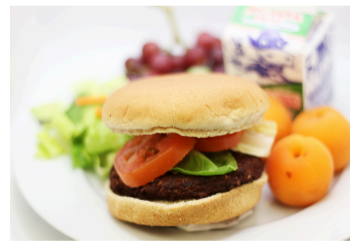
Hamburger, Cheeseburger, Spicy Black Bean Burger