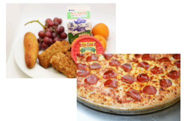
Pizza Crunchers with Garlic Breadstick OR WaveCrest Pizza