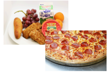
Pizza Crunchers with Garlic Breadstick OR WaveCrest Pizza