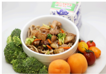
Teriyaki Chicken with Yakisoba Noodles