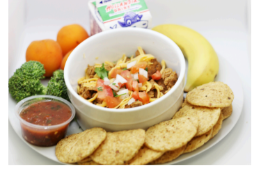
Fiesta Taco Bar