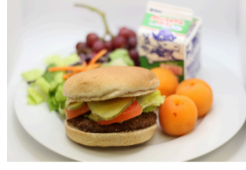
Hamburger, Cheeseburger, Spicy Black Bean Burger