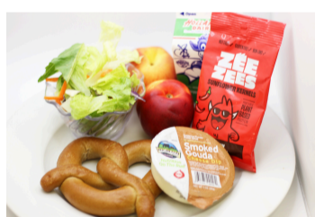
Soft Pretzel & Cheese