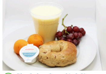
Blenderless Smoothie & Cinnamon Raisin Bagel with Cream Cheese