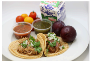
Carnitas Street Tacos