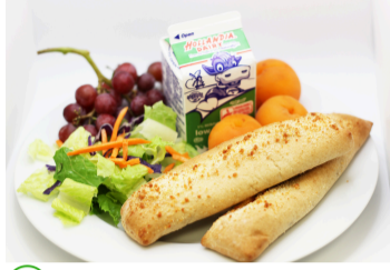
Cheesy Pizza Sticks