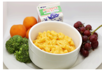
Mac & Cheese