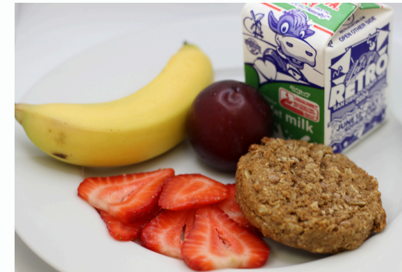
Baked Egg Bites with Mini Muffin OR Ultimate Breakfast Oatmeal Round