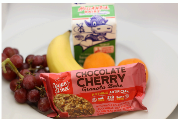
Sausage & Cheese Burrito OR Chocolate Cherry Oatmeal Granola Bar