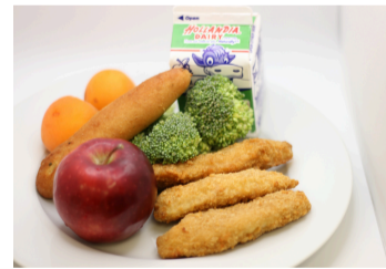
Chicken Tender Basket with Garlic Breadstick