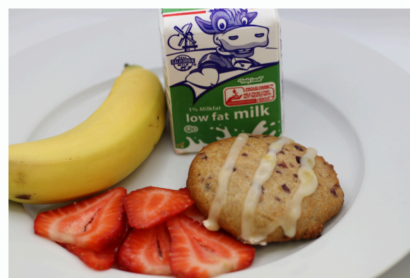
Pizza Toast OR Whole Grain Cranberry Orange Scone