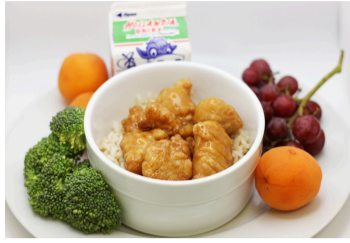
Orange Chicken & Rice