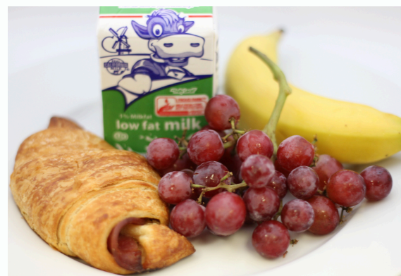
Orchard Crunch Parfait with Homemade Granola OR Ham & Cheese Croissant