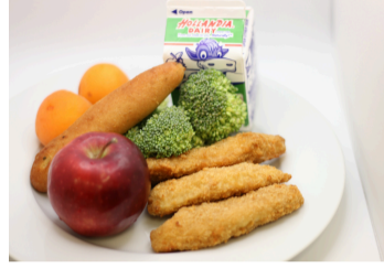
Chicken Tender Basket with Garlic Breadstick