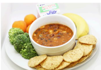
Vegetarian Tortilla Soup