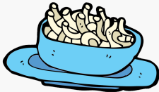
Rotini (3 lbs)