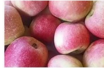
Pink Lady Apples